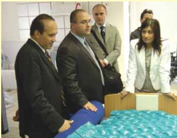
Minister Cubukcu and her entourage examine a special anti-bedsores mattress in the Guidance & Exhibition Center

The Turkish State Minister for Women and Family Affairs, Mrs. Nimet Cubukcu , visited Yad Sarah with a high-level government entourage and toured the many services, expressing special interest in services for people with disabilities.