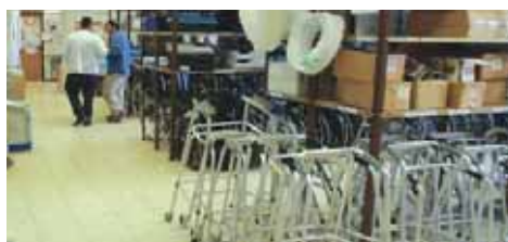
Replenishing the equipment warehouses...

A meeting of minds between C.U.R.E. and Yad Sarah, two organizations with shared goals and values, is bringing help and relief to countless people in Israel.