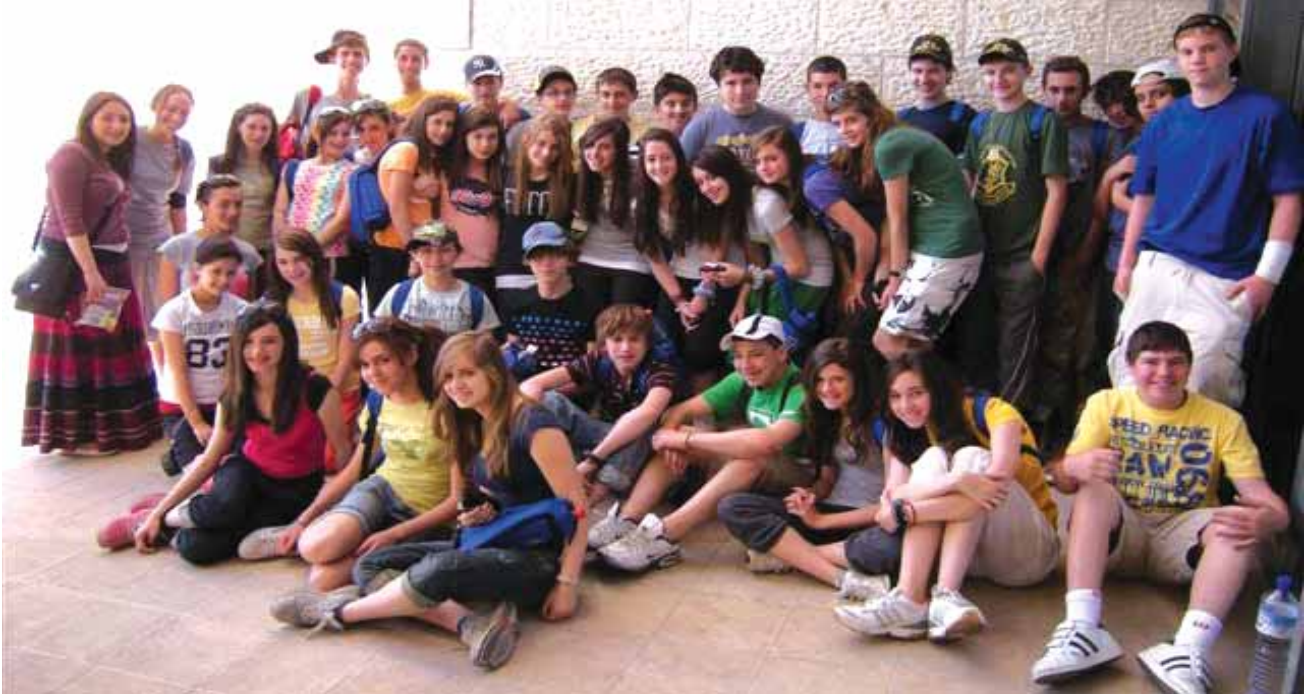
Pupils from London's Jewish Free School at Yad Sarah House