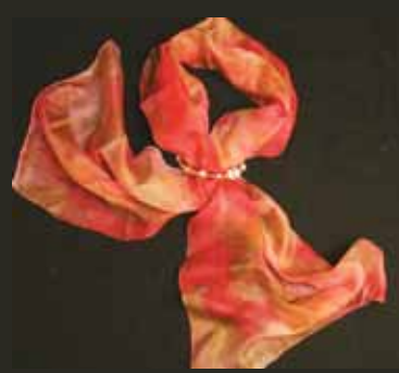
Beautiful silk scarves hand-dyed by rehab center participants, a popular Gift Shop item

New in Yad Sarah’s Rachel Eliachar Gift Shop are in-house made items including a tote bag to hang on a walker, heating bags to be put in the microwave for two minutes instead of a hot water bottle, and gift-packaged newborn baby kits with the items one needs for the first few days, like diapers, pacifiers, baby cream, soap and baby wipes. The latter item is advertised in the lending department so that people who come to borrow baby equipment can know this gift is available across the hall.