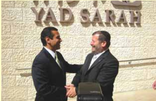
The two Mayors

Mayor of Los Angeles Antonio Villaraigosa , heading a group of city officials and support staff, toured Yad Sarah recently as guests of Jerusalem Mayor and Yad Sarah founder Uri Lupolianski. He said: "We wanted to visit not only because Mayor Lupolianski is its founder,